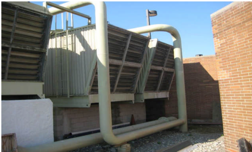
Physical Plant – Cooling tower and basins are near end of life.