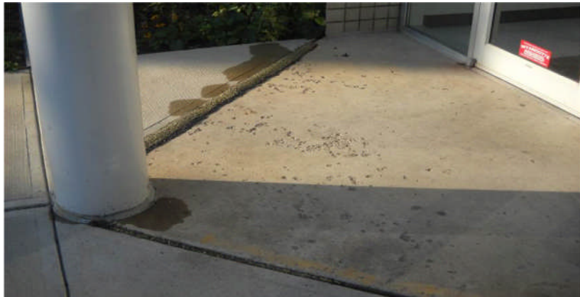
Whitman Center – settlement/heaving of exterior concrete slab (at main entrance) presents a tripping hazard.