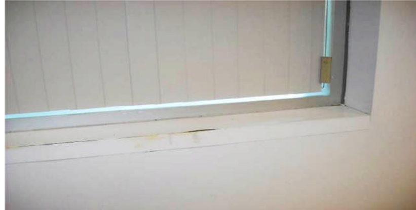
Whitman Center – water infiltration along exterior wall has caused deterioration of the plastic-laminated windowsills.