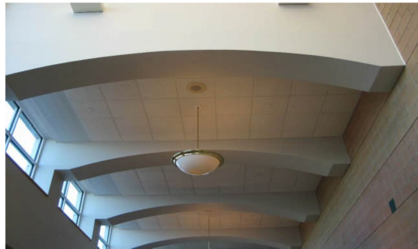
Health Education Building – Daylighting controls for the Atrium would save energy.