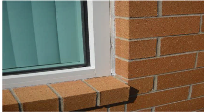
Health Education Building – Typical sealant joint is at end of life.