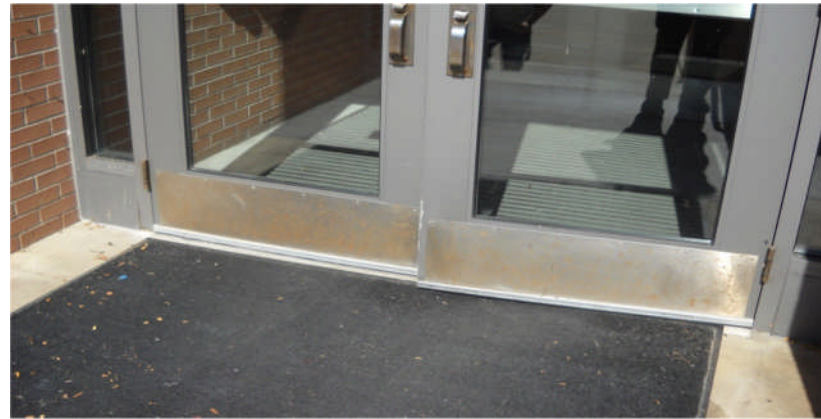
Student Services/Administration – Aluminum entrance doors and hardware at end of life.