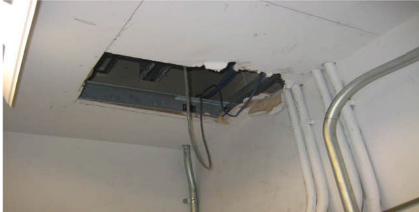
Whitman Center – breach in fire-rated ceiling assembly.

The following images are examples of different facility conditions across MCCC campuses.