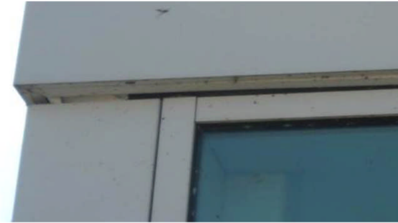
La-Z-Boy Center – It appears there is a void within the exterior aluminum, curtain wall assembly allowing the environment to enter the interior.